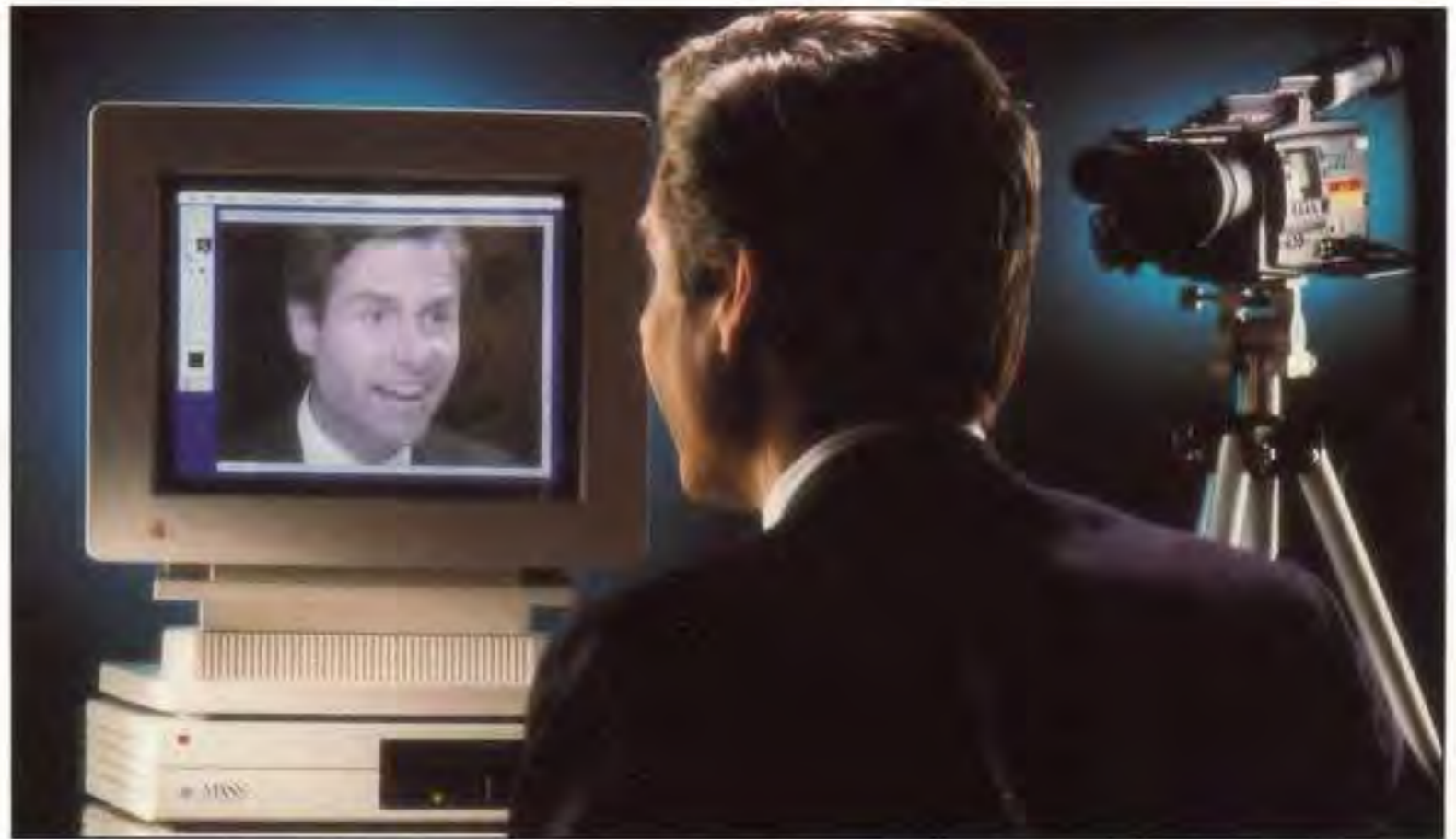
QuickImage 24 brings the excitement of video images to your Macintosh-created publications, presentations, and artwork.