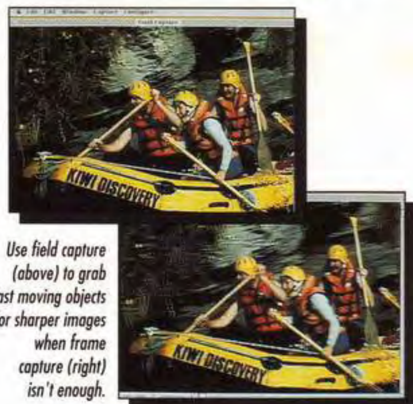
Use field capture (above) to grab fast moving objects for sharper images when frame capture (right) isn't enough.

Only QuickImage 24 gives you a user-selectable Field Capture mode that lets you capture fast moving objects. Field capture at 1/60th** of a second allows you to capture a single field of video that reduces blurring, resulting in sharper images.