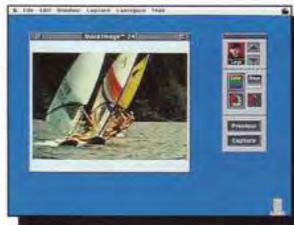
The preview window lets you view and capture the frame you want.

QuickImage 24 features a live Preview window which lets you see the incoming video and pick the image you want. The Preview window displays video at 5 to 30 frames per second, depending on the window size and color setting.