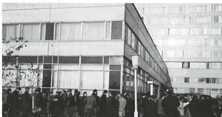
Soviets line up for Auto CAD Expo Moscow '88.

"I was struck by the difference between what I saw and my expectations. The Russians discussed the changes in their country openly and intensely; in doing so, they complained so much about the government and bureaucrats that for a moment, I thought I was back in the States!"